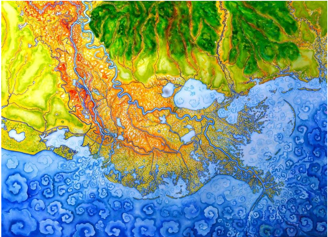
Deep in the Heart of Louisiana 4' x 6' watercolor by Driftwood Johnnie

Starting Wed, Oct 21st, we'll be paddling the last 255 miles of the Mississippi River in 2 voyageur canoes, down the main channel through New Orleans to the Gulf of Mexico, via Southeast Pass. (Most expeditions have been taking the South Pass, but following a tip from Lower Mississippi Riverkeeper Paul Orr, we'll be trying a new route with more wildlife and less traffic.) The adventure includes Baton Rouge, Bayou Manchac, Plaquemine, Bayou Goula, White Castle, Donaldsonville, Paulina, Audubon Point, Algier's Point. Below the Moonwalk we'll take a